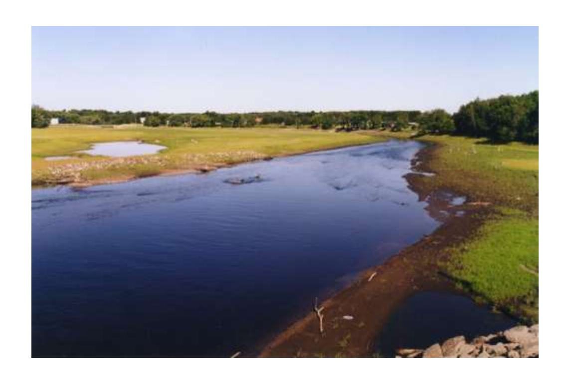
Former impoundment of Ward Dam, 2 years after removal

Former impoundment of Ward Dam, 1 year after removal